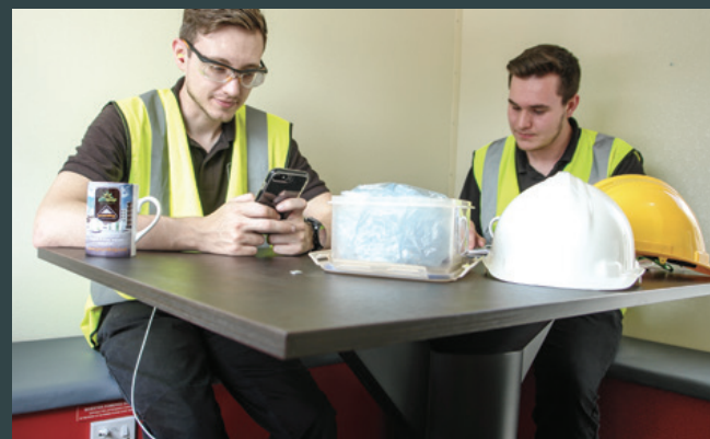
BATTERY POWERED USB SOCKET