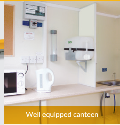
Well equipped canteen