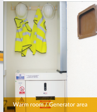
Warm room / Generator area