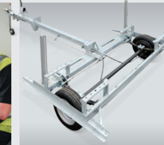
FULLY HOT-DIPPED GALVANISED CHASSIS