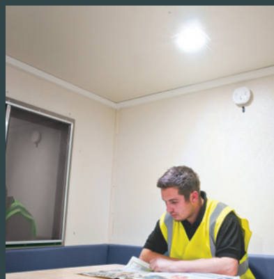
BATTERY POWERED LED LIGHTING